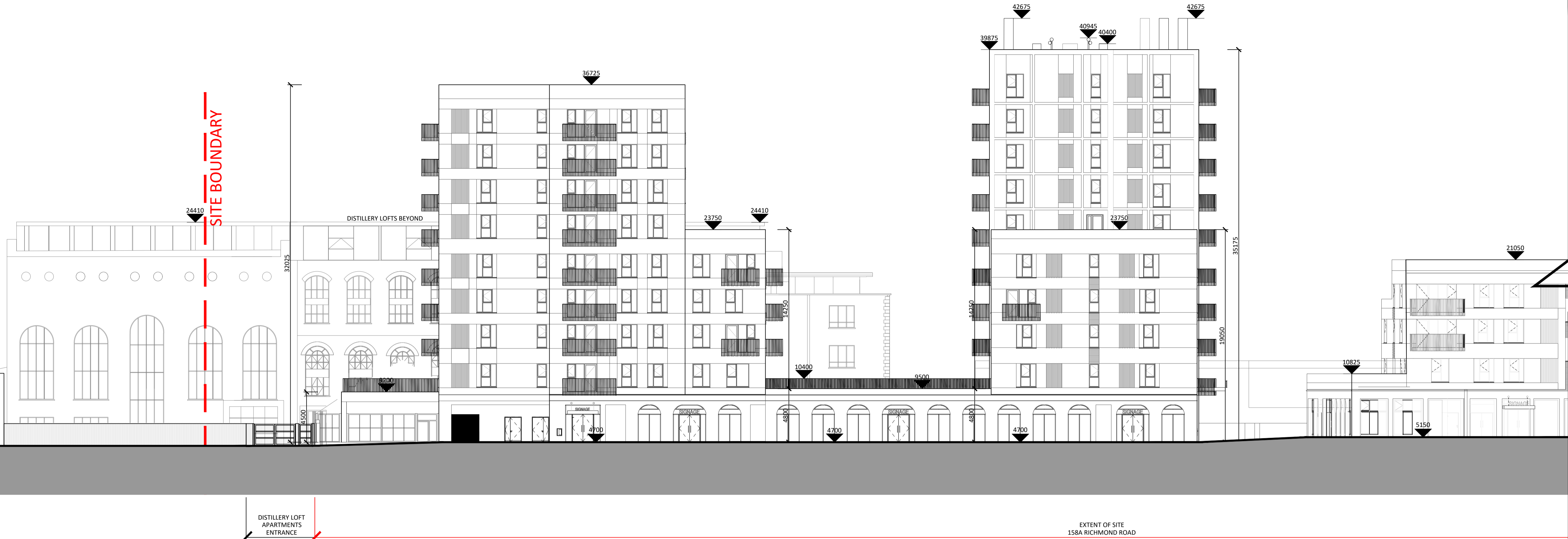
1 1304B_Proposed Contextual North East Elevation Along Richmond Road_A-A - SCENARIO B 1 : 200